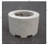
proposed planter acting as vehicle barrier